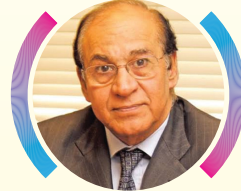
TARIQ IKRAM (SI) - Former Minister of State - Chief Executive, Trade Development Authority of Pakistan "Unlocking Exponential Growth Through Exports"