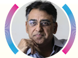
ASAD UMAR Minister for Planning, Development and Special Initiatives Speech at the Pre-Conference Workshop Tuesday, February 18, 2020