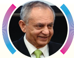
ABDUL RAZAK DAWOOD Adviser for Commerce, Textile, Industry & Production and Investment of Pakistan